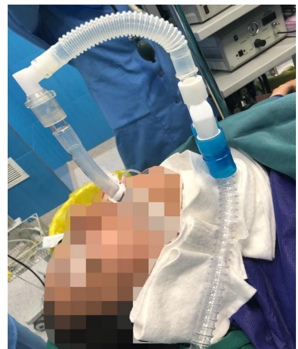
Figure 1- Soft padding applied between the corrugated tubes and the neck.

The authors declare no conflicts of interest.