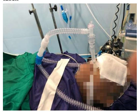
Figure 2- Adhesive tape applied approximately 10 cm below the sternal notch for fixation of the corrugated tubes.

This standardized method proved highly effective in the fixation of LMA especially in orthopedic cases where