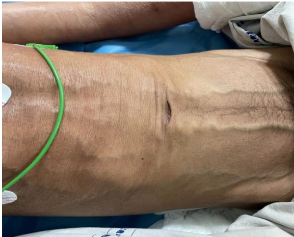
Figure 1- Patient's abdomen with visible dilated veins

Routine blood work ordered showed a haemoglobin of 11.4 g/dL and a white cell count of 20,200/cumm. His platelet counts, liver and kidney functions, serum electrolytes and coagulation profile were found to be within acceptable limits. Chest radiograph revealed gross mediastinal widening (Figure 2) and ultrasonography was suggestive of bilateral pleural effusion with pericardial effusion. Injectable Piperacillin-tazobactam and Clindamycin were prescribed for the patient, apart from steroids (dexamethasone), diuretics (furosemide), usual ICU sedation, ulceroprophylaxis and thromboprophylaxis. Early nasogastric feeding was planned.