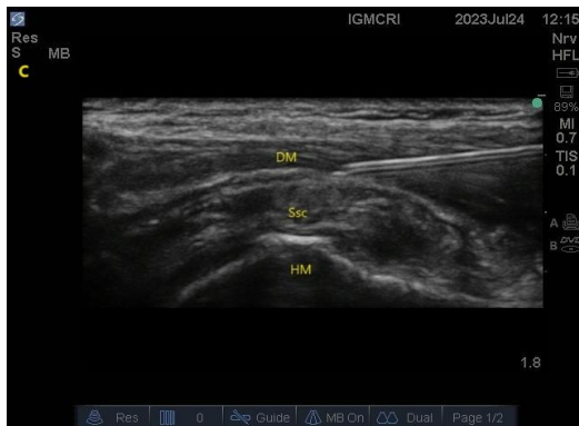
Figure 1C-Interfascial injection

CP-Coracoid process, DM-Deltoid muscle, Ssc-Subscapularis, HM -Humerus