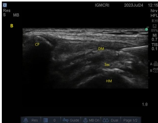
Figure 1B- Sonoanatomy of SHAC block

CP-Coracoid process, DM-Deltoid muscle, Ssc-Subscapularis, HM -Humerus